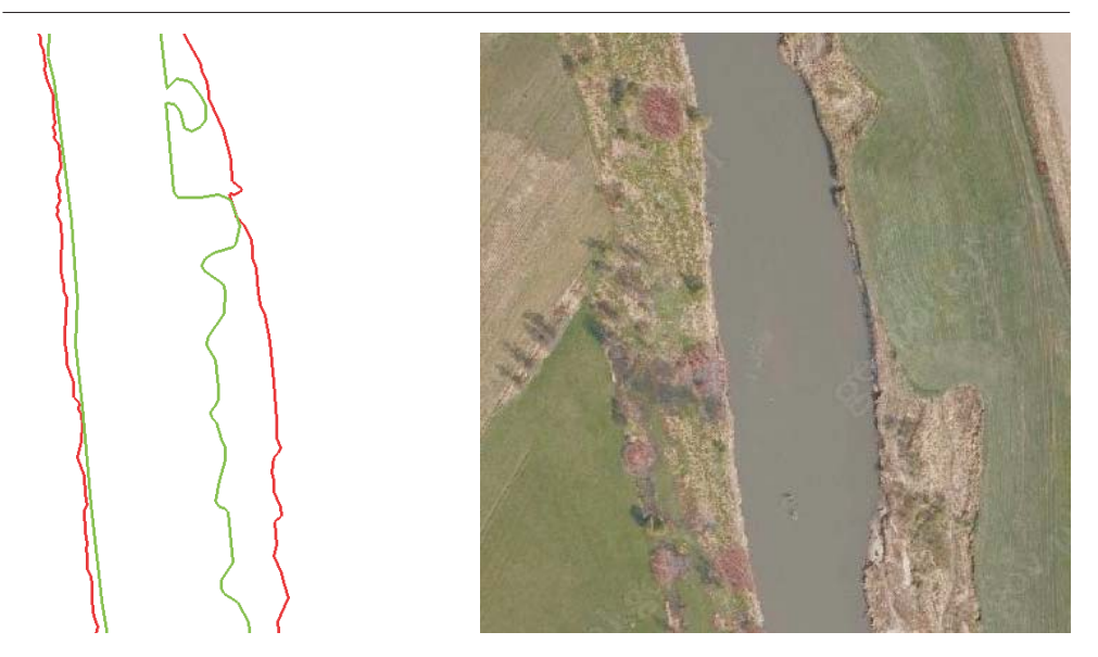
Fig. 1. Change of shape of the river-bed in years 1977–2009, section between cadastral units Czernichów and Pozowice Source: [10]