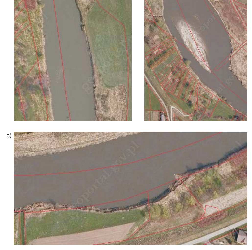
Fig. 4. Comparison between the current river-bed boundary with data boundaries coming from the grounds and buildings register: a) in relation with figure 1; b) in relation with figure 2; c) in relation with figure 3