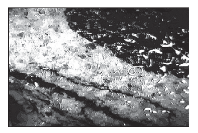
Fig. 4. Image of a borehole wall with its visible granular structure and fissures

The image analysis system associated with a digital video system enable a complete automatic image processing. The image is sharpened, and soft-focused and/or illegible image frames are deleted. The system arranges images in a continuous column, by means of an artificial neurone network, next it decodes information about the camera location, and marks out a millimetre scale on the picture.