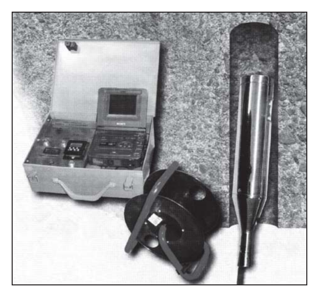
Fig. 1. Introscopic camera to examine rock structure penetrated by drilling operations