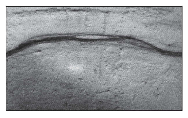
Fig. 3. Image of the fissure crossing the borehole

The visual field of the lens mating with the camera designed for a borehole of 45 mm dia is 12 \times 12 mm and such a visual field fills the monitor screen. Using a monitor screen of 17" diagonal for image survey, accuracy of fissure gap measurement of 0,1 mm (or even better) can be provided — see Figure 3.