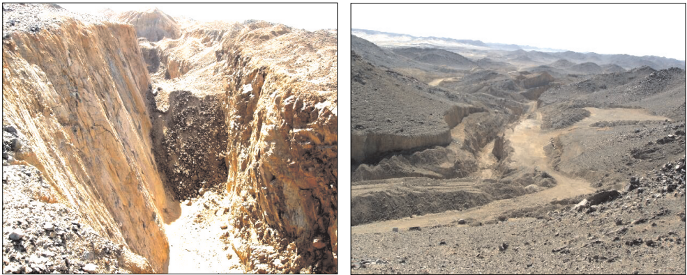
Fig. 1. The surface mining of baryta

Location where the works were executed is the Jibal Fukhda Mountain, located north-eastwards from the town called Rabigh. Since first discovered in 1950's, the Umm Gerad baryta deposit was exploited using the surface method. Surface-near sections of baryta veins were exploited in the disintegrated, cracked zone, with small amount of blasting works carried out. Depth of the surface mining reaches 20–30 m with the neck width of about 6 m (Fig. 1). It has also been verified in the past that baryta mineralization continues down to the above mentioned depth. Further possible deposit exploitation is therefore conditioned by verification of continuing baryta mineralization in economically interesting development.