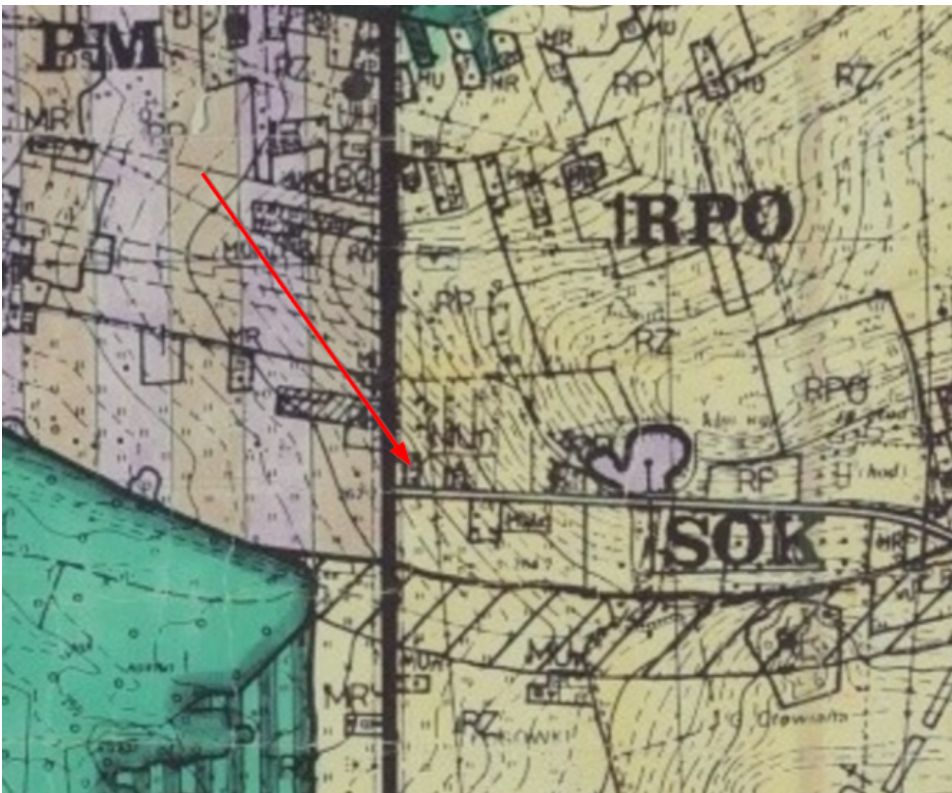
Fig. 3. Fragment of drawing part of study of conditions and directions of spatial development

The owner of such real estate will not apply for a planning permit, since a house is already located there. Of course (theoretically speaking), the owner could have applied for such a permit, especially that the conditions of the neighboring parcels would probably have made it possible to be obtained. However, literal interpretation of Art. 54 of the Real Estate Management Act leads us to the conclusion that the parcel in question cannot be developed for single-family housing (according to the provisions of the study). As a consequence, such properties should be considered for real estate valuation purposes whose intended use is similar; i.e., those with no possibility of housing development, which naturally decreases the value of the property. Properties that are similar to the one being valued and differ in their use are listed below.