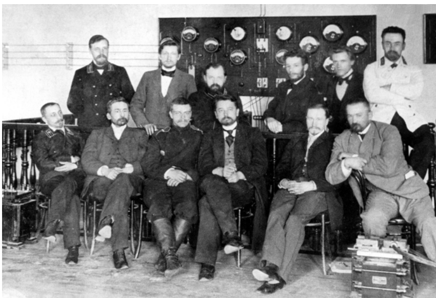
The first teaching staff, 1901.

The Dnipropetrovsk Mining Institute was an instrumental organizer of other institutions, such as: the Dnipropetrovsk State Medical Academy (1920), the State Metallurgical Technical University of Ukraine and the Ukrainian State University of Chemistry and Technology (1930), the Moscow Welding Institute (1925), the North Caucasian Mining and Metallurgical Institute (1931), the Scientific Research Tube Institute (1929), the Scientific Research Mining Institute (1925), the Institute of Physical Chemistry of the National Academy of Sciences of Ukraine (1927), the Institute of Mining Mechanics of the National Academy of Sciences of Ukraine (1945), the Scientific Research Institute of Coal (1928), the Institute of Rock Mechanics of the National Academy of Sciences of Ukraine (1967), and the Institute “Dniprodiprosht” (1928).