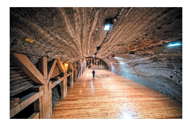
Fig. 2. "Ważyn" Chamber

in Chorzów. It was transported to Bochnia from the closed salt mine in Wapno. It served the longest of all steam engines in the Polish mining industry, until 1996. Tourists cover the route on foot, although there is the opportunity to travel by train (Ldag-05M locomotive with wagons adapted to transport tourists) or by boat along a certain part of the trail. A visit to the mine ends with a stop in the "Ważyn" Chamber (Fig. 2), which houses a restaurant, a souvenir shop, a sports field, and a playground for children.