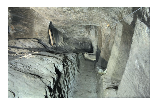
Fig. 3. Traces of salt blocks loosening

The route, which was made available in 2014, leads tourists through the oldest excavations of the mine in Bochnia, where rock salt was extracted from the Middle Ages to the beginning of the 20<sup>th</sup> century. Before going underground, the groups undergo specialist training at the Mine Rescue Station, where they are equipped with mining equipment, i.e.: a helmet, a lamp and a carbon monoxide absorber [11]. The expedition starts on the "Danielowiec" level (the first shallowest level of the mine). This is where the tour of the Old Mountains, i.e. the oldest preserved excavations, begins. There are many interesting places along the route, both with regard to the old mining technique and the geological structure of the deposit. One of the excavation complexes is the so-called "Kalwaria" descent, connecting the "Danielowiec" and "August" levels, with a total length of ca 650 m and a height difference of 110 m. This descent includes the "Śmierdziuchy" and "Stanetti" chambers. One of the most interesting is the "Stanetti II" Chamber (Fig. 3), leading to a steep descent, which was made by three techniques: stairs carved in the rock mass, wooden steps and a wooden suspended structure.