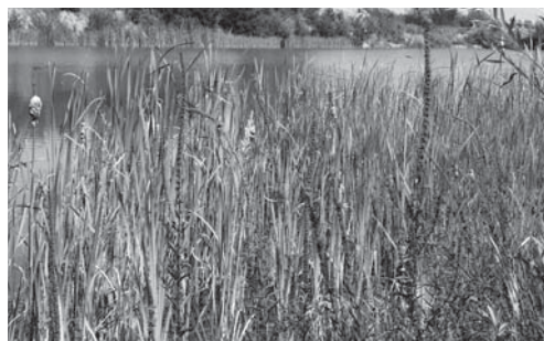
Fig. 2. Dębina Łętowska: natural succession of flora

The sand and gravel quarry Dębina Łętowska, located on the border of two communes, namely Wojnicz and Wierchosławice, may be used as an example (Fig. 2, 3). Kopalnie Odkrywkowe Surowców Drogowych w Rudawie S.A. (previous owner) had at its disposal the decision of the Wojnicz Commune Head under which the method of the mined land reclamation and redevelopment was said to suit the agricultural purposes — i.e. intensive fish farming — for a part of the post-mining area within the Wojnicz Commune. That Decision was issued in 1993 based on the mined land reclamation provisions contained in the deposit development project and concerned the part of the land located only in the Wojnicz commune, failing to include the land from the Wierchosławice commune. It is also worth mentioning that the two communes do not have current local land use plans.