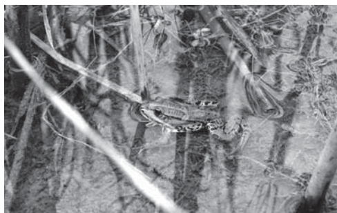
Fig. 3. Dębina Łętowska: natural succession of fauna

In 2011, Lafarge applied for a decision on the mined land reclamation purposes and drew up a mined land reclamation project for all workings. Initially, it was checked whether the agricultural purpose of the mined land reclamation, i.e. intensive fish farming, was attainable in a reservoir 8 to 10 metres deep [2]. J. Śliwiński PhD, Eng., a worker of the Department of Ichthyobiology and Fisheries [2] was asked to issue an opinion in this regard. In accordance with that opinion, it is not possible to carry out intensive fish farming in a reservoir of this depth, but such an area may be used for fishing purposes, including sport fishing, as an additional way of taking advantage of the reclaimed reservoir's fishing productivity potential. Given the water's low trophic level, it was suggested that the adjacent areas should be reclaimed for natural purposes. Based on those two premises, the agricultural purpose of the reclamation – with a water-based, economically useful specification – which was proposed for the post-mining working and a natural purpose for the adjacent areas [2]. In figure 4 one can see the original concept of reclaiming the post-mining reservoir for intensive fish farming purposes, carried out in two reservoirs.