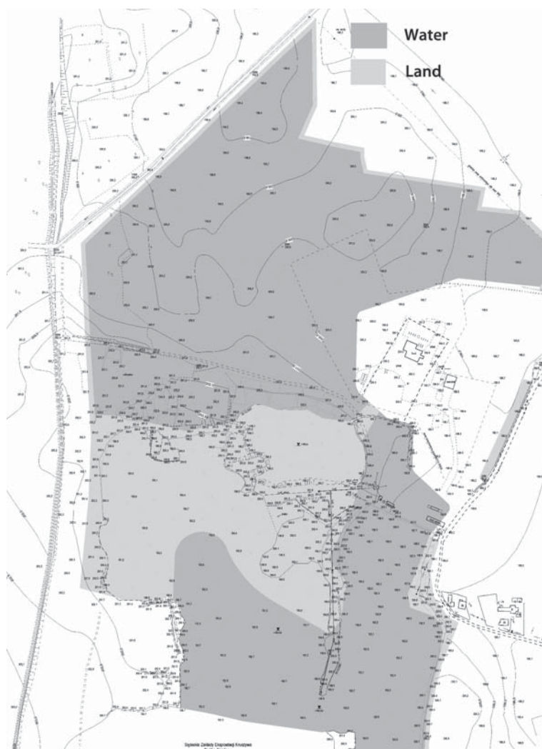
Fig. 4. The map for the project of the “Dębina Łętowska I” deposit development plan providing for a set-up of two reservoirs 8 to 10 metres deep [1]

The commune’s another suggestion was to merge two workings into one reservoir and make it more shallow in order to set up a beach. Analyses were made to find out whether it was possible to make a gradual descent into the water as regards the existing reservoir, and how much the change of the place for filling up the water above the water table would affect the profitability and possibility of conducting mining operations [2].