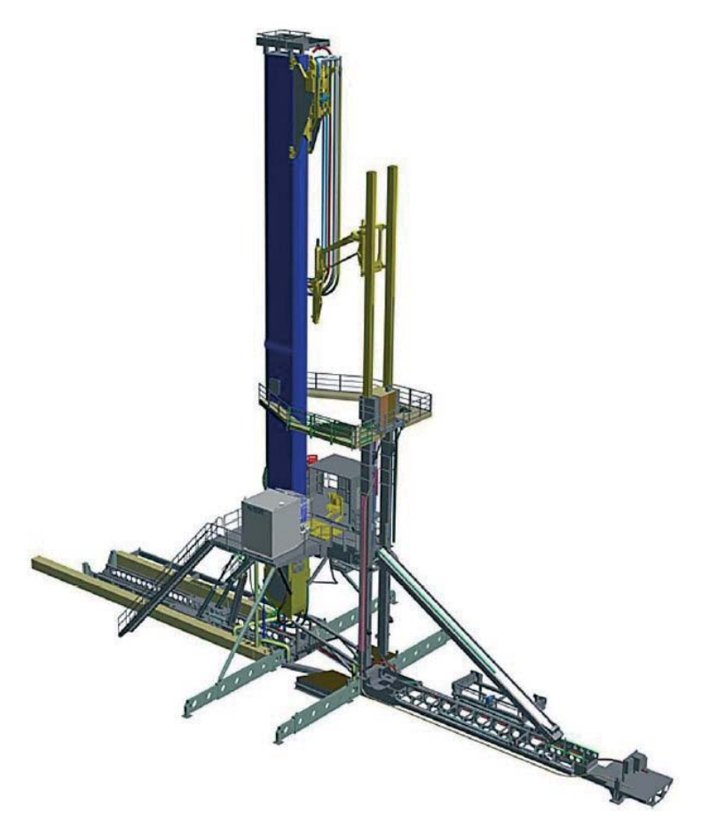
Fig. 1. New Rig Concept

Breitburn rack and pinion rig is 250 sh ton pulling, 120 sh ton pushing, equipped with a top drive with similar capacities, manual pipe handling and mud systems. All movement is by AC motors [10], which runs off the LA downtown power grid (Fig. 1).