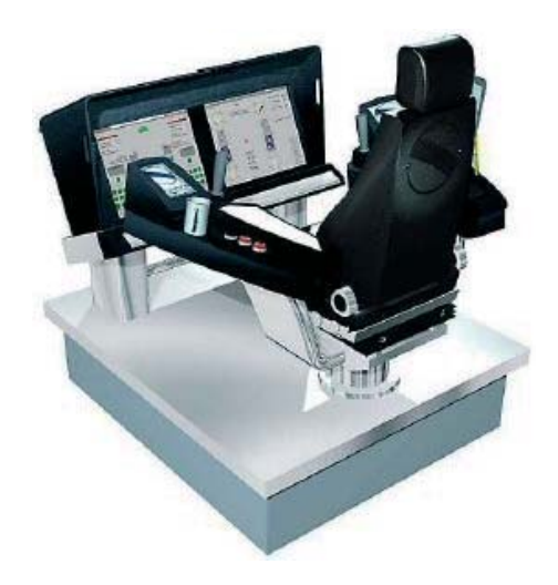
Fig. 4. X-COM operator's chair

The operator uses two large LCD screens to monitor all equipment, systems and operations. This is the operator's information central, where traditional gauges, indicators, bar graphs and video screens are integrated into one, compact, graphical interface that may take any shape. Control of equipment is by two touch pads and two joysticks mounted in arm consoles attached to the chair. This substitutes traditional switches, buttons and throttles. As all interface is graphical and drawn on screens, the X-COM chair change to reflect the status of the current operation. This makes operation of the R&P Land Rig more intuitive and simple, as the user is only exposed to the information and functions that are currently used. Additional information is provided with a full alarm system, rig status screens, trend screens.